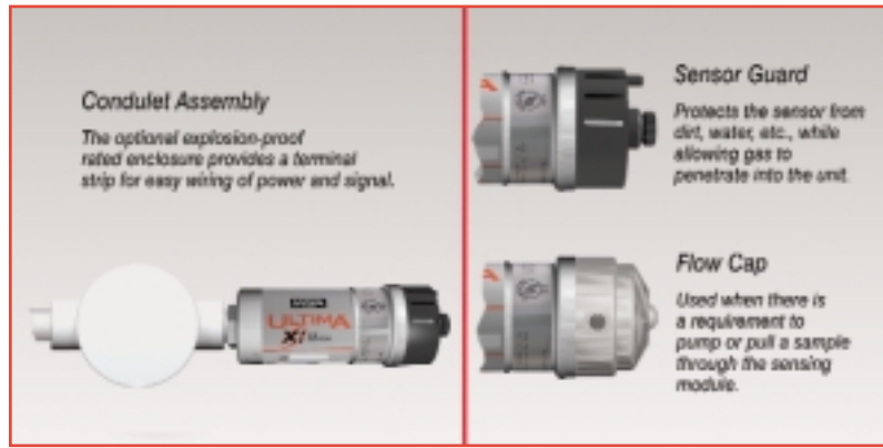
Ultima XI Accessories