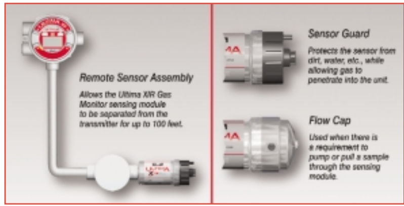
Ultima XIR Accessories