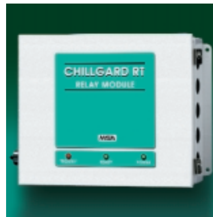
Chillgard RT Refrigerant Monitor Relay Module

The Chillgard RT Remote Relay Module provides discrete relay outputs on a per-channel basis when the Multipoint Sequencer is in use. Eight, sixteen, or twenty-four relays can be utilized to provide a