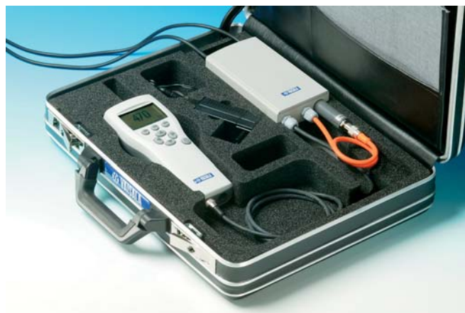
The GM70 in pump-aspirated mode is used for example to check incubators in the field.

CARBOCAP® is a registered trademark of Vaisala. Specifications subject to change without prior notice. ©Vaisala Oyj