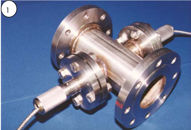
1 - Flanged pipe transmittance mode