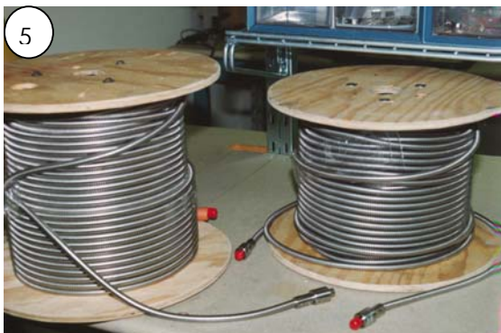
5 - Fiber optic cable can be used to connect the analyzer to measurement points hundreds of feet away.