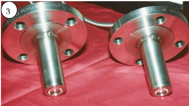
3 - Transmittance probes