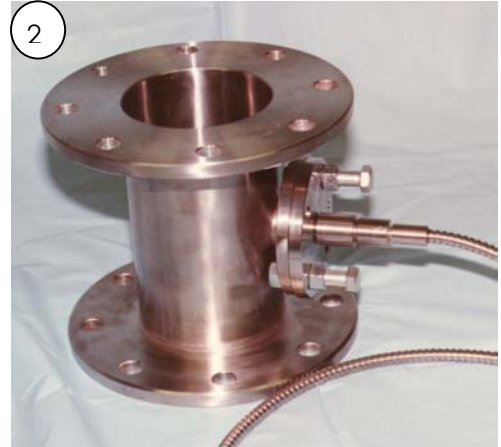
2 - Flanged pipe transreflectance